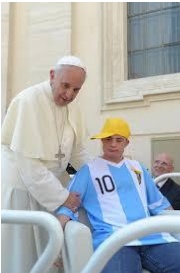
Pope Francis lets boy ride his 'Popemobile'

As we head into our Easter holiday break I want to share with you the image I saw on the news this morning which made me smile and was a great start to my day.